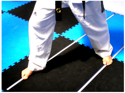
Correct Forward Stance